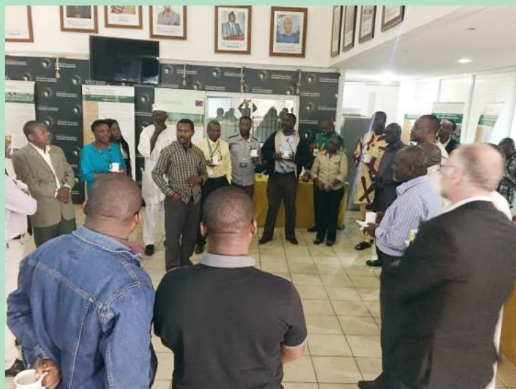
AU-IBAR Animal Welfare Task Force Members sharing a light moment with other AU_IABR staff during a tea break at their Headquarters in Museum hill, Nairobi