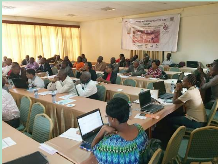
Participants at the National Donkey Conference held at Sportsman's Arms Hotel, Nanyuki