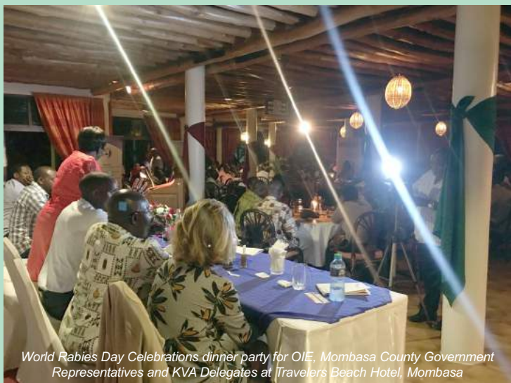
World Rabies Day Celebrations dinner party for OIE, Mombasa County Government Representatives and KVA Delegates at Travelers Beach Hotel, Mombasa