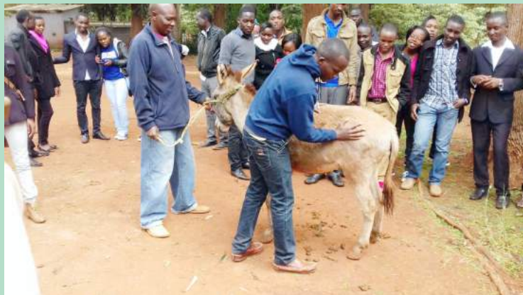
A practical learning session on donkey behaviour and handling at KSPCA with students of the University of Nairobi School of Veterinary Medicine

learning sessions and teacher education activities in nine primary schools in Kitui (Mwingi), Kajiado and Lamu counties. Through this education approach, we have reached many people both directly and indirectly with the message of good animal care practices.