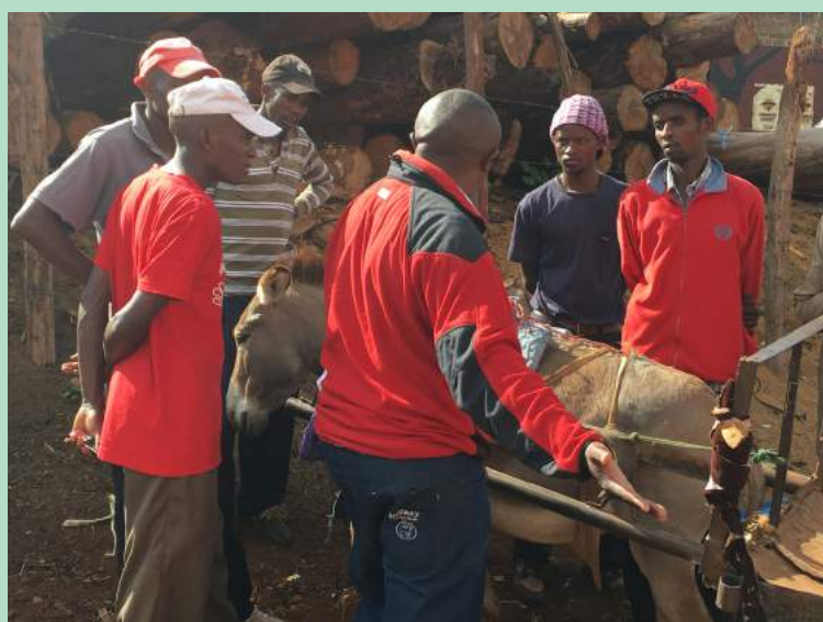
Practical session on loading and working practices at Ruringu, Nyeri