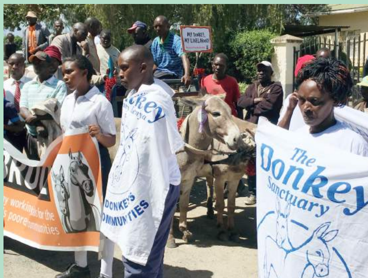
A procession to mark Donkey day was held in Nanyuki Town

In the serene Island of Lamu, business literally came to a standstill as DSK championed the values of the donkeys and their contribution to livelihood through song and