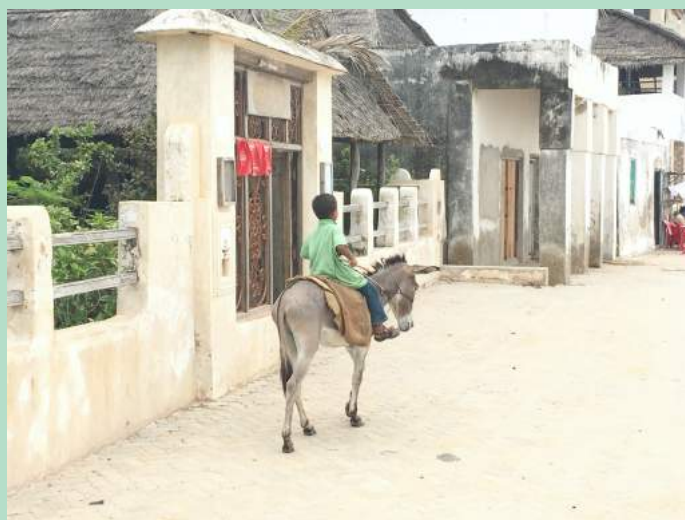
Never too young to ride: a boy at ease and at peace with his donkey in Lamu.