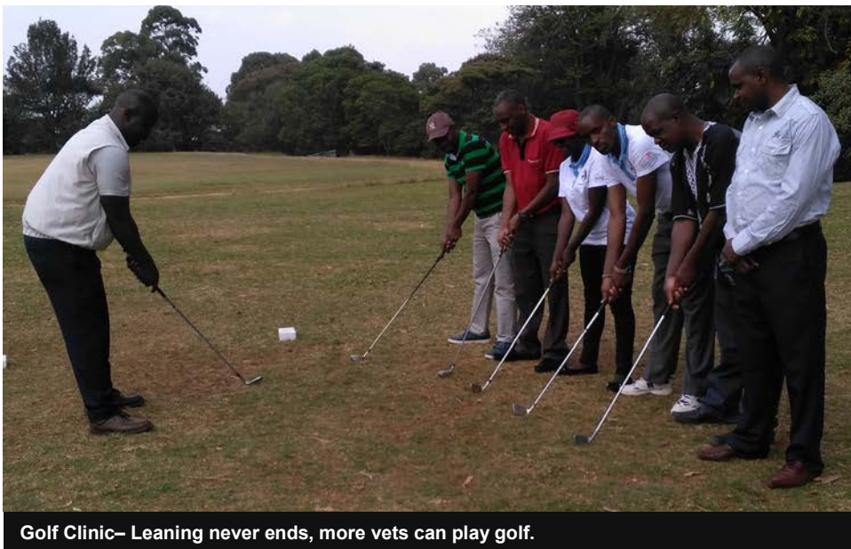
Golf Clinic– Leaning never ends, more vets can play golf.