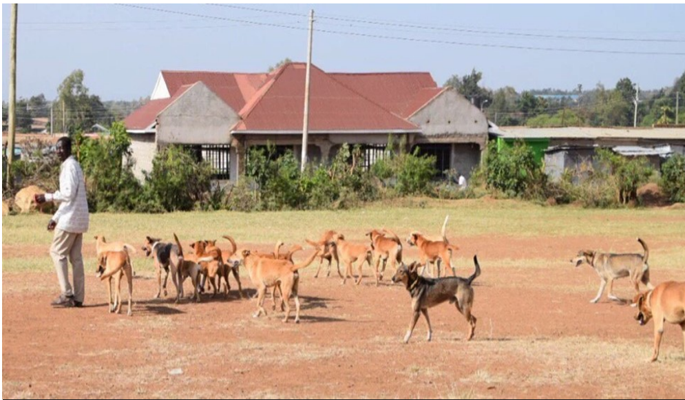
A man leads away his 48 dogs after they were vaccinated against rabies