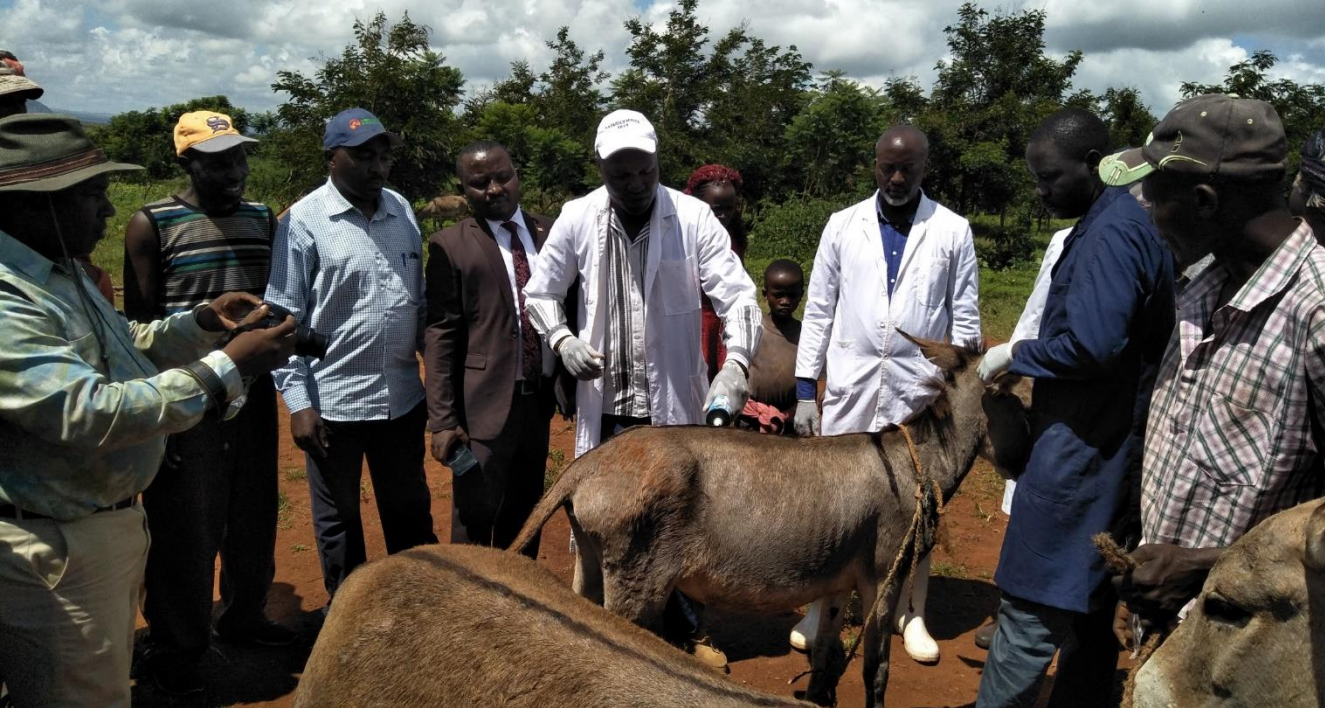
Demonstration on ectoparasite control using Ectopor®