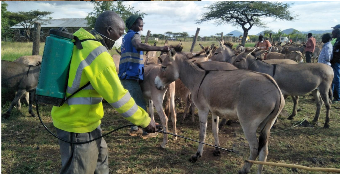
Ectoparasite control using Vectocid®